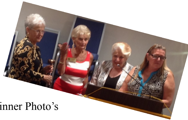
Installation and Scholarship Winner Photo's